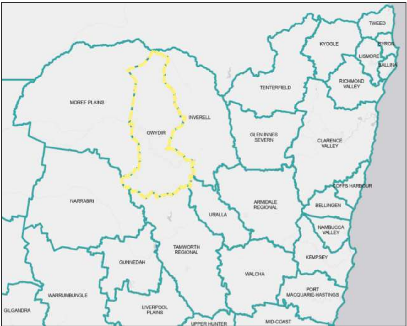
Figure 1 Gwydir Shire LGA

The proposal does not seek to amend the zones to which the existing exempt provisions apply. However, the planning proposal does not explain the zones to which the provisions apply.